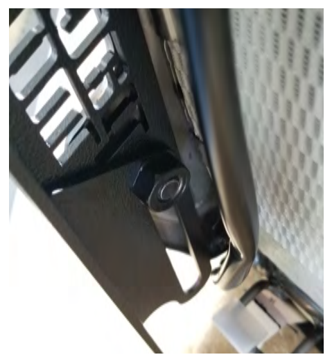
pg.5 of 6